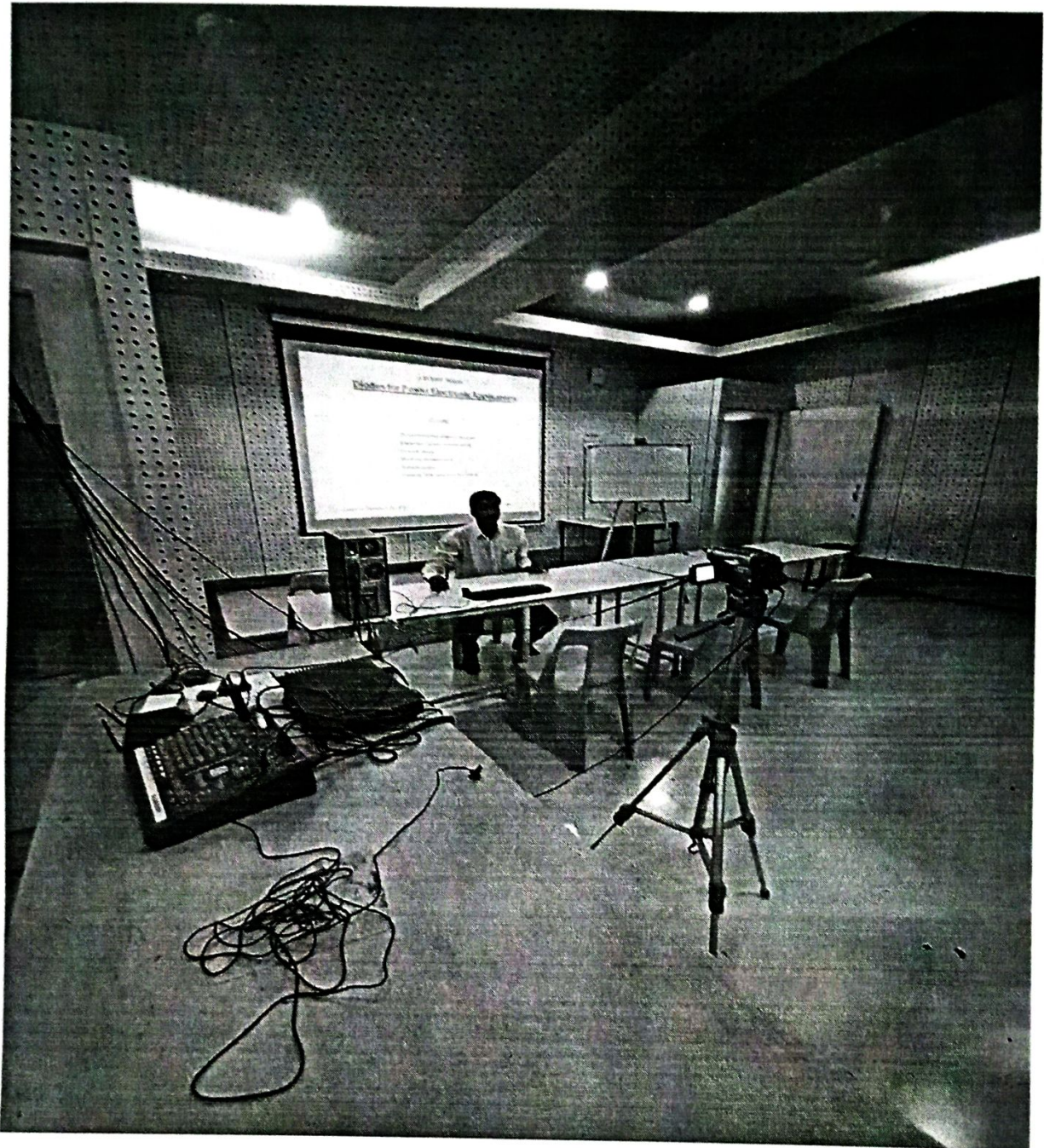
Photo of Recording Studio