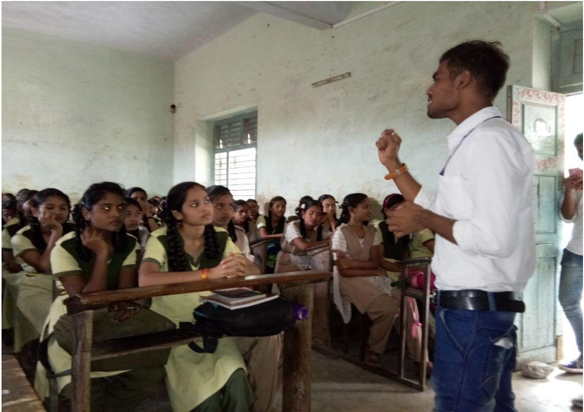
TEACHERS DAY CELEBRATION (SOCIAL ACTIVITY- FUND RAISING FOR KERALA FLOOD RELIEF FUND)