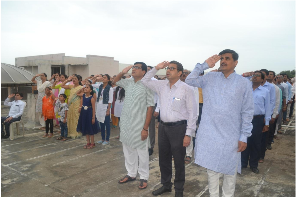
WOMENS DAY CELEBRATION