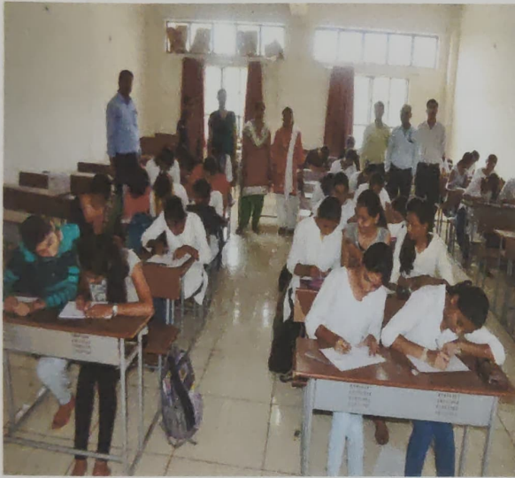
DAY 4: Drawing/Painting competition