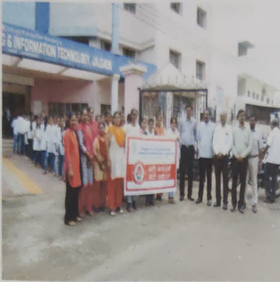
DAY 2: Prabhat Pherry/Rallies