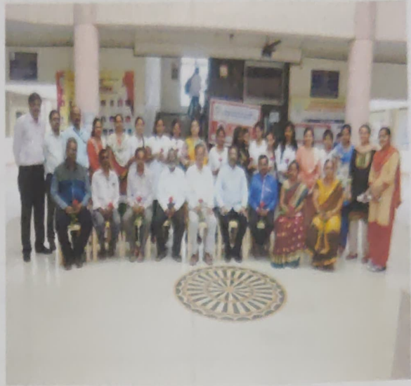
DAY3: Celebration of girl child and felicitate the parents