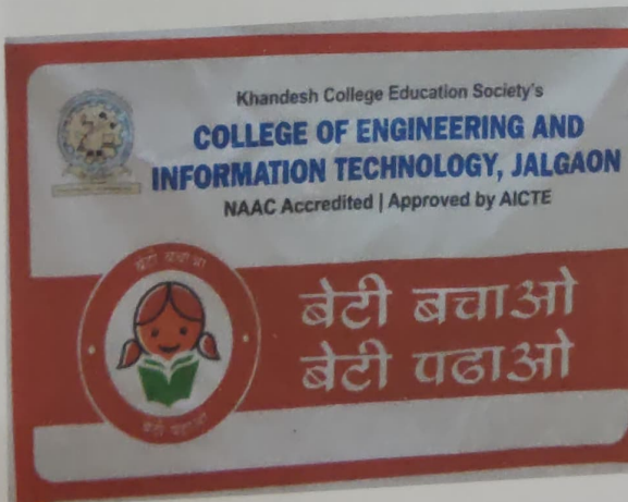
DAY 1: Signature/Pledge board at college level