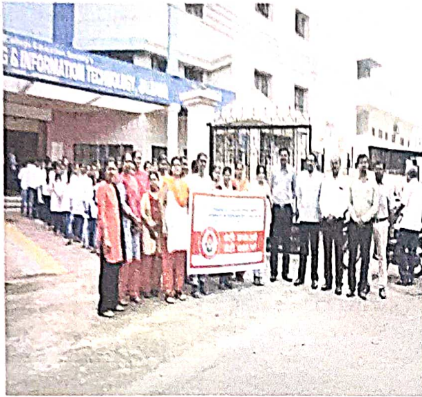
DAY 2: Prabhat Pherry/Rallies