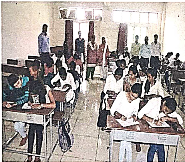
DAY 4: Drawing/Painting competition