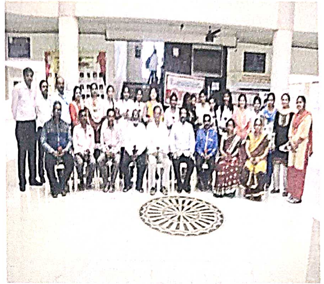
DAY3: Celebration of girl child and felicitate the parents