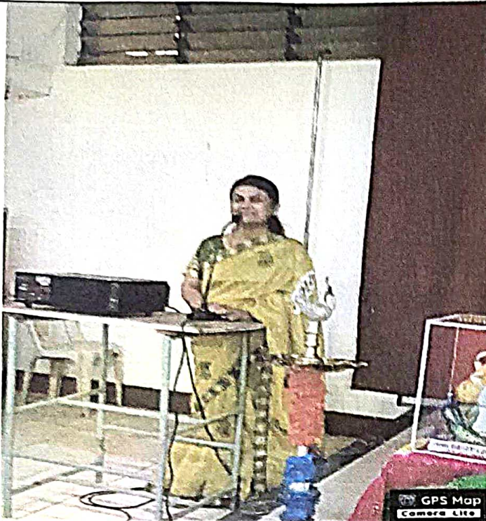
B-1/7, Sangam Society, Ring Rd, near Gujarathi Samaj Sattya Vallabh Hall, Ganesh Colony, Jalgaon, Maharashtra 425001, India Latitude Longitude 21.00766759° 75.55319898° Local 03:01:52 PM Altitude 155.9 meters GMT 09:31:52 AM Tuesday, 08-03-2022