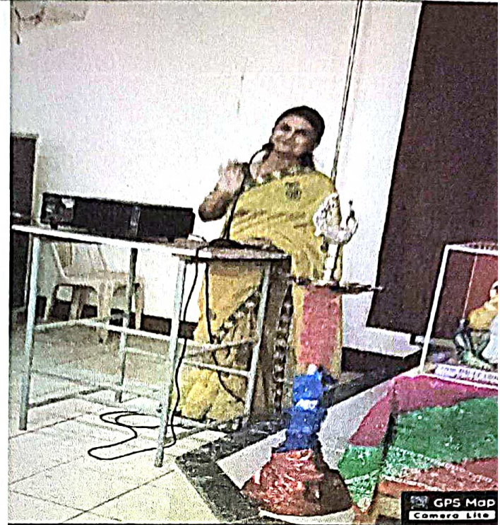
B-1/7, Sangam Society, Ring Rd, near Gujarathi Samaj Sattya Vallabh Hall, Ganesh Colony, Jalgaon, Maharashtra 425001, India Latitude Longitude 21.00761853° 75.55321805° Local 03:04:13 PM Altitude 158.28 meters GMT 09:34:13 AM Tuesday, 08-03-2022