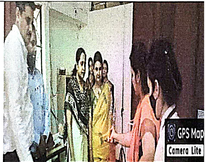
Dinanathwadi Rd, Ganesh Colony, Jalgaon, Maharashtra 425001, India Latitude Longitude 21.0075439° 75.55308843° Local 02:50:34 PM Altitude 169.26 meters GMT 09:20:34 AM Tuesday, 08-03-2022