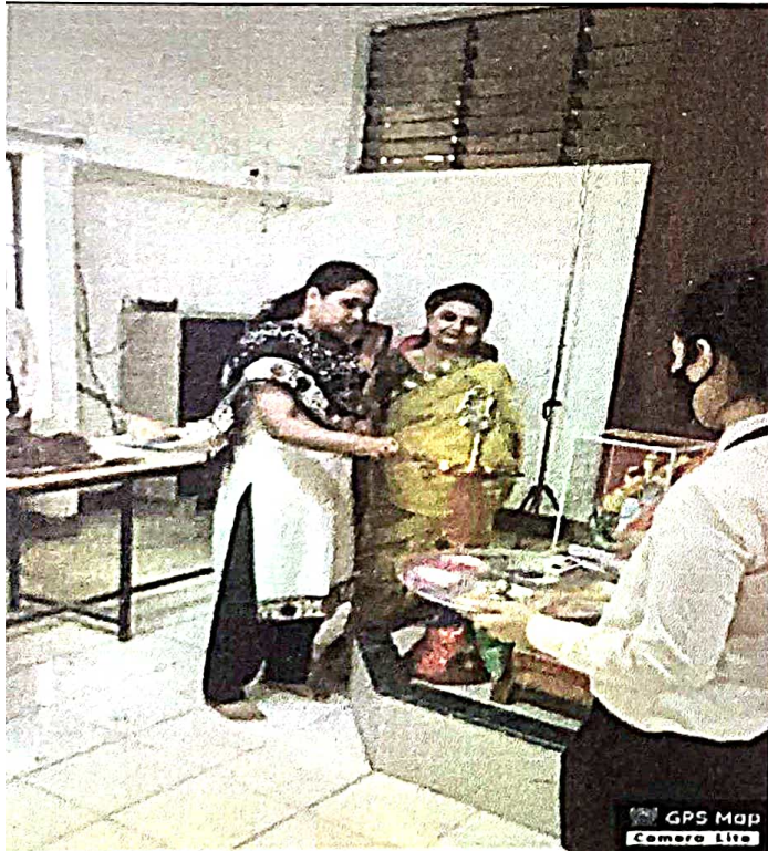
Dinanathwadi Rd, Ganesh Colony, Jalgaon, Maharashtra 425001, India Latitude Longitude 21.00754587° 75.55306335° Local 02:50:58 PM Altitude 166.5 meters GMT 09:20:58 AM Tuesday, 08-03-2022